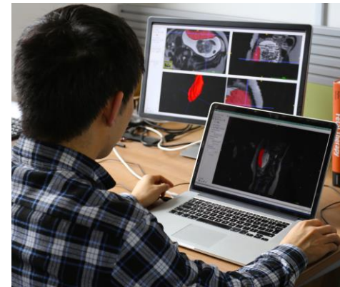
A researcher working on anonymised fetal MRI images